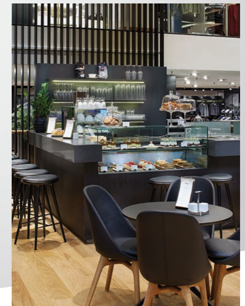
Table reservations at JOHANNNS restaurant phone: 08581 - 208 2000 Closed on Sundays and public holidays.